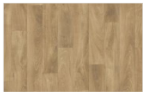
French Oak Lt Natural