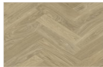
Skane H/bone Brown