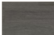
Shadow Studio Oak KP150