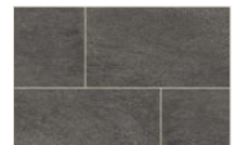
Cumbrian Stone ST14