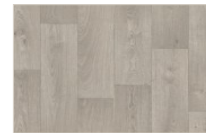
Swan Medium Grege