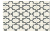
Monochrome X Shadow