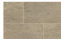
Portland Stone ST13