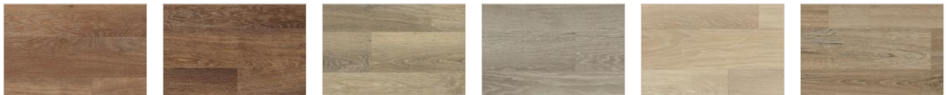
Pale Limed Oak KP94

12mil wear layer • 2.0mm thick • 100% waterproof • Lifetime residential warranty • Wood planks & stone tiles