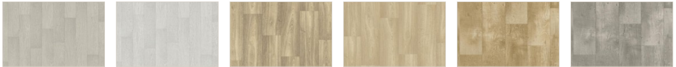
Derby Light Grey

2.6mm • R10 slip • Phthalate-free • Underfloor heating compatible • 15-yr warranty • 2m, 3m & 4m widths