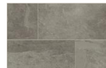
Grey Riven Slate ST16