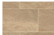
Bath Stone ST12