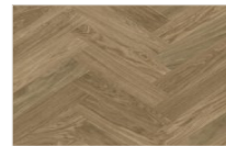
Skane H/bone Walnut