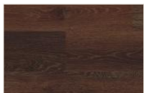
Aged Oak KP98